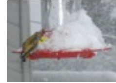
The jewels of winter.